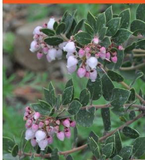
Arctostaphylos edmundsii 'Big Sur'

CA native Shrub to 3 ft. tall Full sun to part shade Hardy to 10° F