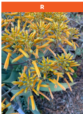
Aloe buhrii hybrid

Hybrid with South African parentage Shrub to 5 ft. Full sun Hardy to 25° F