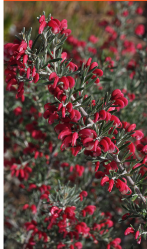
Grevillea lavandulacea 'Penola'

Native to southeastern Australia Shrub to 4-5 ft. tall Full sun Hardy to 20° F