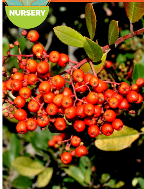
Heteromeles arbutifolia (fruit)

(Toyon) California Native Shrub or small tree to 20 ft. Full sun to partial shade Hardy to 10°