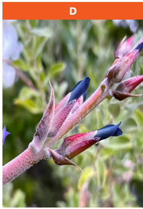
Puya laxa x coerulea

Native to Australia Tree to 25 ft. tall Full sun Hardy to 18° F