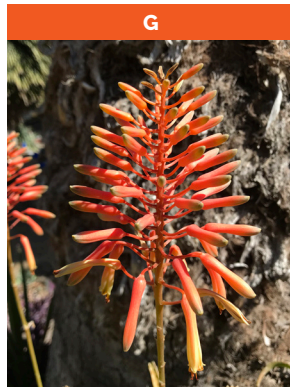
Aloe kedongensis hybrid

Hybrid with South American parentage Clump of silvery rosettes to 3½ ft. tall Full sun to partial shade Hardy to low 20's F