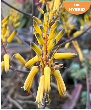
Aloe labworana x hildebrandtii