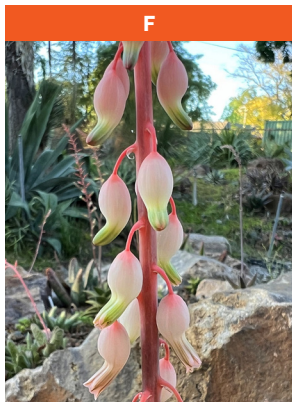
Gasteria 'Monroe's Silver'

Native to Texas Perennial to 2 ft. tall Full sun to partial shade Hardy to 0° F