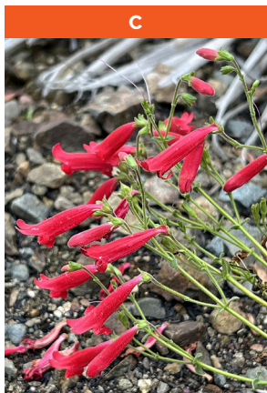
Penstemon baccharifolius 'Diablo'

Native to western Mexico Clumping; stemless rosettes to 14 in. Ø Full sun to partial shade Hardy to 26° F