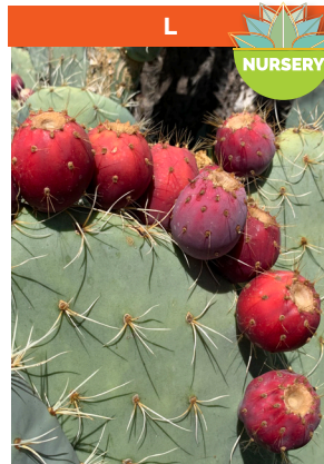
Opuntia robusta (fruit)

Native to South Africa & Namibia Stemless rosette to 2 ft. Ø Full sun Hardy to 27° F