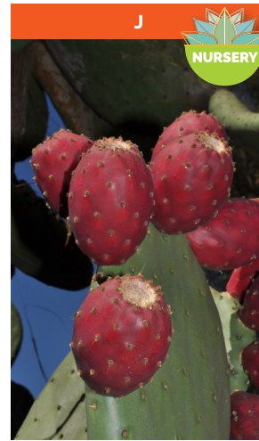
Opuntia ficus-indica (fruit)

Hybrid; parents from East Africa Shrub to 4 ft. tall Full sun to partial shade Hardy to mid-20's F