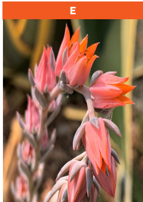
Echeveria peacockii hybrid

Native to SW U.S.A. & Mexico Perennial to 2ft. tall Full sun Hardy to 10° F