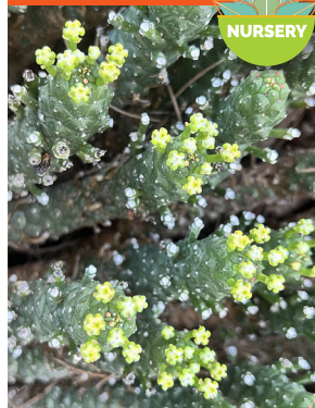
Euphorbia medusoid hybrid

Hybrid with South African parentage Stemless; to 1½ft. θ Full sun to partial shade Hardy to low 20's F