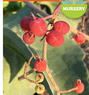
Cyphostemma juttae (poisonous fruit!)

Native to Namibia Thick-stem shrub to 4-6 ft. tall Full sun to partial shade Hardy to 25°