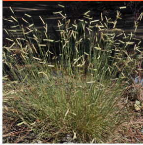
Bouteloua gracilis 'Blonde Ambition'

Native to western North America Clumping grass to 2ft. tall Full sun to half sun Hardy to below zero F