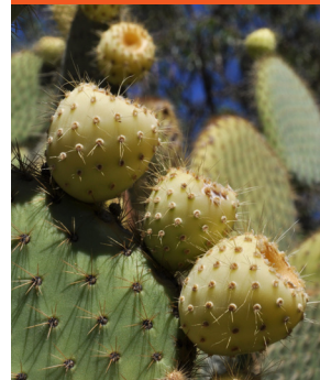
Opuntia leucotricha (fruit)

Native to central Mexico Tree-like growth to 12' tall Full sun Hardy to 20° F