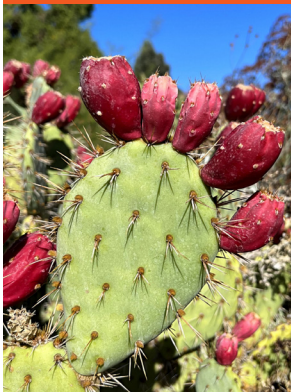
Opuntia vaseyi (fruit)

Native to southern California Shrubby; to 2 ft. tall Full sun Hardy to 20° F