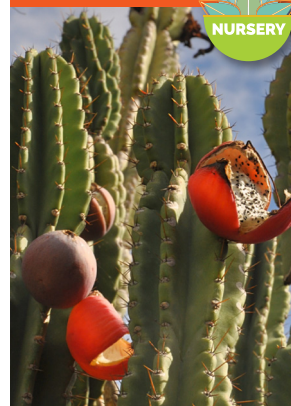
Cereus hildmannianus (fruit)

Native to South America Much-branched tall columnar cactus Full sun Hardy to low 20's