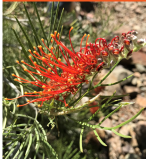
Grevillea 'Kings Fire'

Hybrid; parents from Australia Shrub to 5-6 ft. tall Full sun Hardy to 25° F