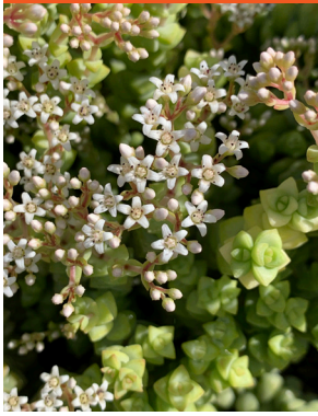
Crassula rupestris 'Tom Thumb'

Native to South Africa Clump-forming, to 6 in. tall Full sun to partial shade Hardy to 28° F