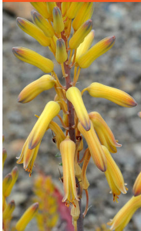
Aloe labworana x hildebrandtii

Hybrid; parents from Uganda & Somalia Clumping; rosettes to 3 ft. Ø Full sun to partial shade Hardy to 30° F