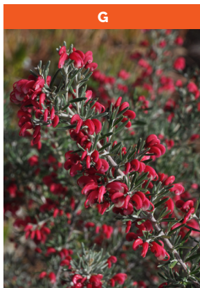
Grevillea lavandulacea 'Penola'

Hybrid with Mexican parentage Stemless rosette to 2½ ft. 0 Full sun to partial shade Hardy to low 20's F