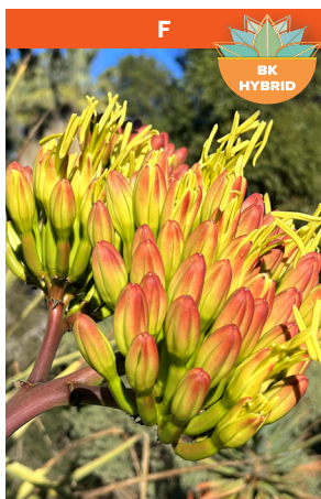
Agave parrasana x colorata

Native to Madagascar Stemless rosette with heads to 3' 0 Full sun Hardy to 25° F