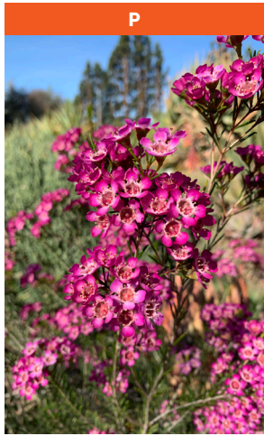
Chamelaucium 'MB Violet'

Native to Australia Shrub to 6 ft. tall Full sun Hardy to 25° F