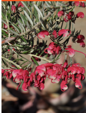
Grevillea lavandulacea 'Penola'

Native to SE Australia Shrub to 4-5 ft. tall Full sun Hardy to 20° F