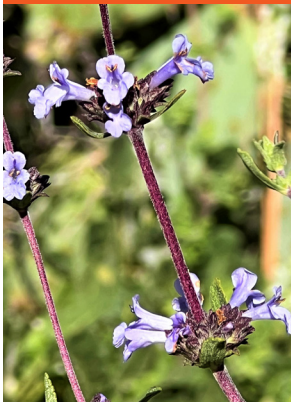
Salvia munzii 'Emerald Cascade'

San Diego Sage California native Shrub to 2 ft. tall Full sun to partial shade Hardy to 20° F