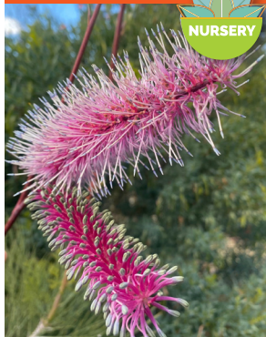
Grevillea petrophyloides 'Big Bird'

Native to Western Australia Shrub to 5' high; flower stalks to 8' Full sun Hardy to 25° F