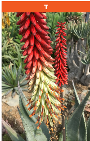
Aloe excelsa x petricola

Native to Mexico Dwarf clumper Full sun to partial shade Hardy to low 20's F