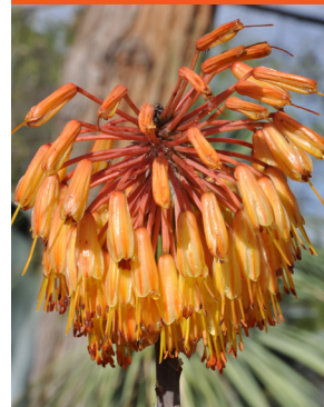
Aloe capitata v. quartziticola

Native to Madagascar Single stemless rosette to 3' Ø Full sun Hardy to low 20's F