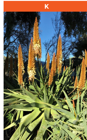
K Aloe 'Creamsicle' Hybrid with S. African parentage Shrub to 8 ft. Full sun to partial shade Hardy to 25° F