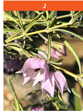
J Guichenotia macrantha Native to Australia Shrub to 5 ft. tall Full sun to part shade Hardy to mid-20's F