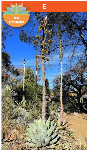
E Agave parrasana * parryi Hybrid, parents from Mexico Rosette to 3½ ft. Ø Full sun to partial shade Hardy to below 20° F