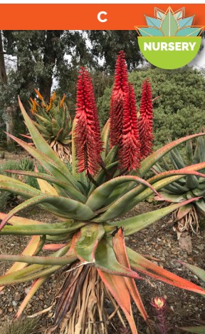
C Aloe ferox Native to South Africa Single rosette to 4 ft. Ø, eventually to 12 ft. tall Full sun Hardy to mid 20's