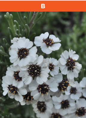
B Eriocephalus africanus Native to South Africa Shrub to 3 ft. Full sun to partial shade Hardy to 25° F