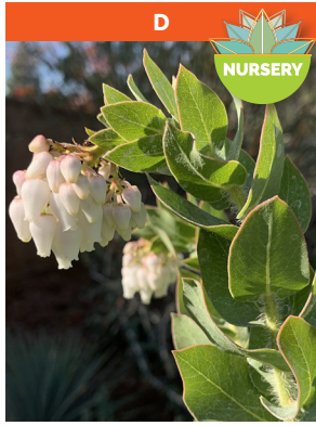
D Arctostaphylos refugioensis California native Shrub to 6 ft. or more Full sun to partial shade Hardy to 20° F