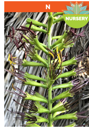
N Agave striata Native to Mexico Clumping, with heads to 2 ft. Ø Full sun to partial shade Hardy to 20° F