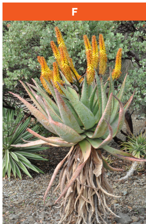
F Aloe marlothii Native to South Africa Single head to 8-10 ft. tall Full sun Hardy to 27°F