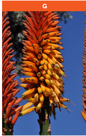
G Aloe 'Tangerine' Hybrid; parents native to S. Africa Multi-stemmed, to 8 ft. tall Sun to part shade Hardy to 24° F