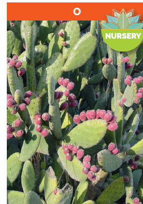
O Opuntia tomentosa (fruit) Tree-like prickly pear Native to Mexico Full sun Hardy to mid-20's F