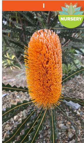
I Banksia ashbyi Native to Western Australia Shrub to 12 ft. tall Full sun Hardy to 22° F