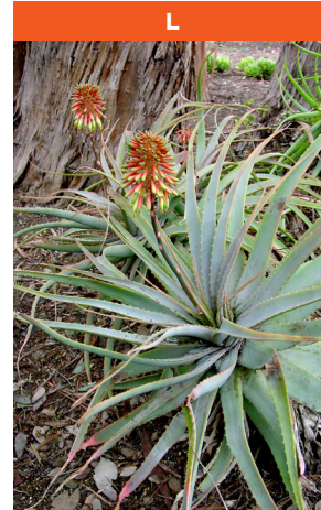
L Aloe mutabilis Native to South Africa Clump to 3 ft. tall Full sun to partial shade Hardy to low 20's