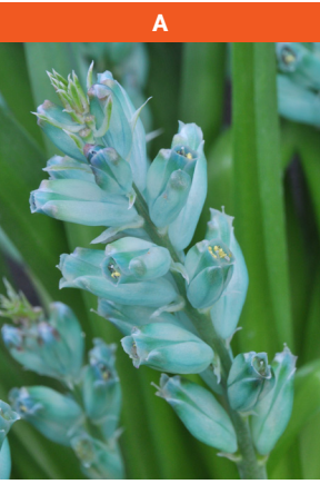
A Lachenalia viridiflora Native to South Africa Bulb to 6 in. tall Full sun to part shade Hardy to low 20's F