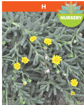
H Othonna capensis Native to SW South Africa Ground cover Full sun to part shade Hardy to low 20's F