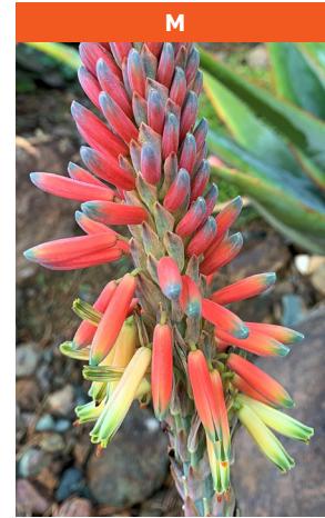
M Aloe microstigma Native to South Africa Single stemless or short-stemmed rosette to 1½ ft. Full sun Hardy to low 20's