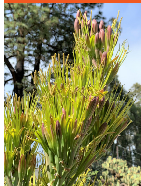
*Mangave 'Blue Fountain'

Hybrid with Mexican parentage Stemless rosette to 3½ ft. Ө Full sun to partial shade Hardy to mid 20's F