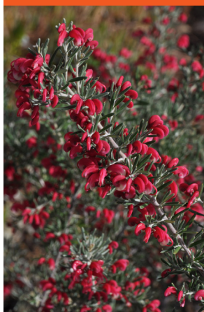
Grevillea lavandulacea 'Penola'

Native to SE Australia Shrub to 4-5 ft. tall Full sun Hardy to 20° F