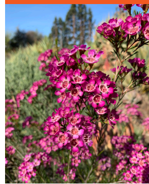
Chamelaucium 'MB Violet'

Native to Australia Shrub to 6 ft. tall Full sun Hardy to 25° F