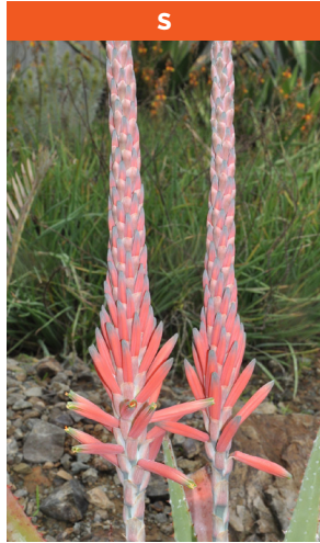
S Aloe suprafoliata Native to South Africa Stemless rosette to 2.5 ft. Ø Full sun Hardy to 25°