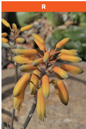
R Aloe zubb x squarrosa Hybrid; parents from Sudan and Socotra Clumping; rosettes to 6 in. Partial shade Hardy to 30° F