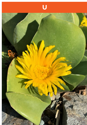
U Glottiphyllum linguiforme Native to South Africa Forms clump to 1½ ft. Ø Full sun to partial shade Hardy to upper 20's