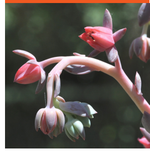
Echeveria 'Mauna Loa'

Hybrid; parents from Mexico Single-headed, to 1½ ft. Ø Light shade Hardy to upper 20's