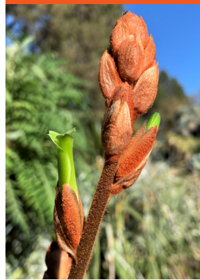
Puya sp. (Chincheru, Peru)

Native to the Peruvian highlands Clumping; stemless rosettes to 1½ ft. Ø Full sun Hardy to upper 20's F