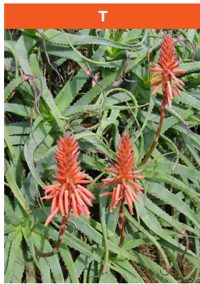
T Aloe arborescens Native to South Africa Shrub to 8 ft. Full sun to partial shade Hardy to low 20's