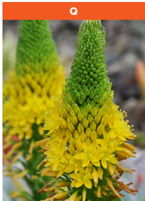
Q Bulbine latifolia Native to South Africa Stemless clumper Part shade to full sun Hardy to mid-20's