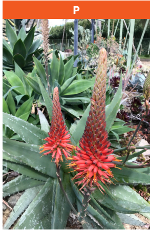
P Aloe hardyi x rubroviolacea Hybrid; parents from S. Africa & Arabia Clumper with rosettes 3 ft. Ø Full sun to partial shade Hardy to 28° F