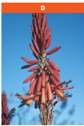
D Aloe rivierei Native to Yemen Clump-forming, to 5-6 ft. tall Full sun to mostly sunny Hardy to upper 20's F