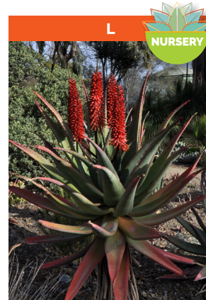
L NURSERY Aloe ferox Native to South Africa Single rosette to 4 ft. Ø, eventually to 12 ft. tall Full sun Hardy to mid 20's F