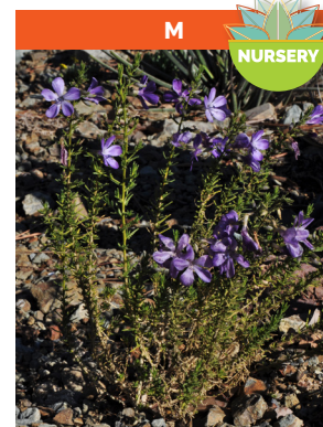
M NURSERY Cantua volcanica Native to Peru Perennial to 2 ft. Full sun to partial shade Hardy to 25° F