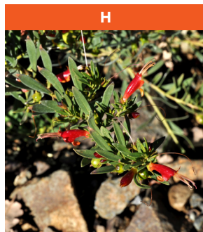
H Eremophila glabra ssp. carnosa 'Winter Blaze' Native to Western Australia Shrub, to 3-4 ft. high Full sun Hardy to 20° F