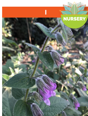
I NURSERY Lepechinia fragrans California native Shrub to 4-5 ft. tall Full sun to partial sun Hardy to 20° F