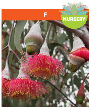
F NURSERY Eucalyptus caesia Native to Western Australia Small tree to 20 tall Full sun Hardy to low 20's F