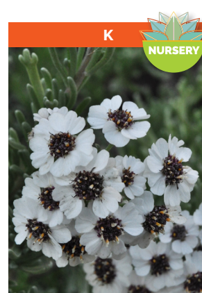
K NURSERY Eriocephalus africanus Native to South Africa Shrub to 3 ft. Full sun to partial shade Hardy to 25° F