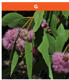
G Eucalyptus lansdowneana ssp. albopurpurea Native to southern Australia Small tree to 25-30' tall Full sun Hardy to 20° F