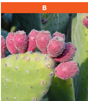
B Opuntia tomentosa Tree-like prickly pear Native to Mexico Full sun Hardy to mid-20's F