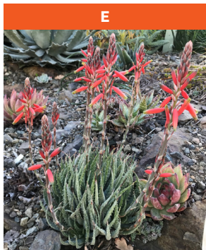
E Aloe humilis x pictifolia Hybrid; parents from South Africa Dwarf clumper to 4 in. tall Full sun to partial sun Hardy to 27° F