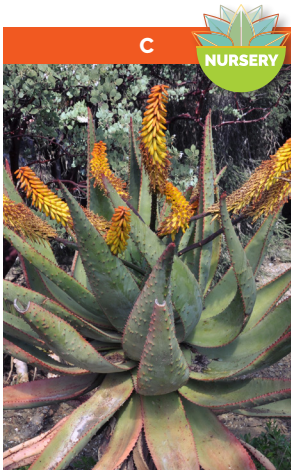
C NURSERY Aloe marlothii Native to South Africa Single head to 8-10 ft. tall Full sun Hardy to 27° F