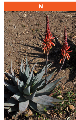
N Aloe framesii Native to South Africa Stemless rosettes to 2 ft. Ø Full sun Hardy to 25° F