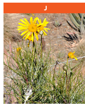
J Euryops speciosissimus Native to western South Africa Shrub to 6 ft. + Full sun Hardy to 25° F