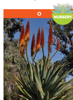
O NURSERY Aloe 'Tangerine' Hybrid; parents native to South Africa Multi-stemmed, to 8 ft. tall Sun to part shade Hardy to 24° F