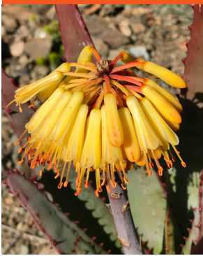
Aloe capitata var. capitata

Native to Madagascar Stemless rosette with heads to 3' Ø Full sun Hardy to 25° F