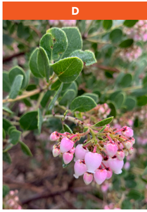
Arcrostaphylos edmundsii 'Big Sur'

Hybrid; parents from CA & Mexico Shrub to 4 ft. tall Full sun to light shade Hardy to 25° F