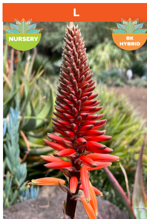
Aloe reitzii hybrid

Hybrid with South African parentage Shrub to 8 ft. Full sun to partial shade Hardy to 25° F