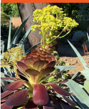
Aeonium arboreum var. atropurpureum hybrid

Hybrid; parents native to the Canary Islands Clump of stems to 5 ft. tall Full sun on coast; partial shade inland Hardy to upper 20's F F