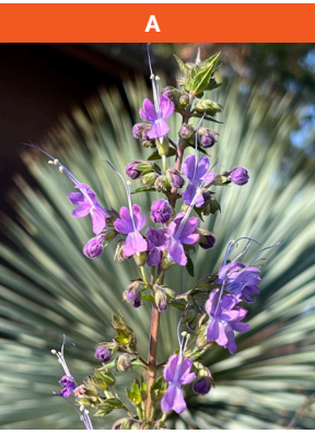
Trichostema 'Midnight Magic'

Hybrid; parents from CA & Mexico Shrub to 4 ft. tall Full sun to light shade Hardy to 25° F