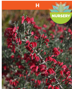
Grevillea lavandulacea 'Penola'

Native to Peru Perennial to 2 ft. Full sun to partial shade Hardy to 25° F