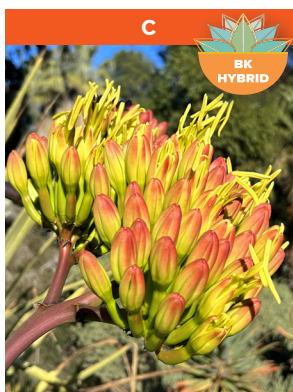
Agave parrasana x colorata

Native to Mexico Stout trunk & multiple heads of drooping leaves To 10 ft. tall Full sun to partial shade Hardy to low 20's