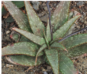
Q Aloe brandraaiensis

Native to southern South Africa Single or branching; slowly develops trunk of up to 12 ft Full sun Hardy to upper 20's