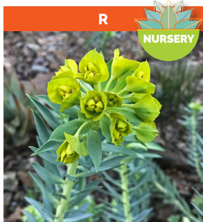
R Euphorbia rigida

Native to South Africa Stemless rosettes to 2 ft. 0 Full sun to partial shade Hardy to 27° F