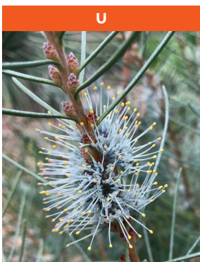
U Hakea lehmanniana

Native to northeastern South Africa Usually single rosettes Full sun to part shade Hardy to mid-20's