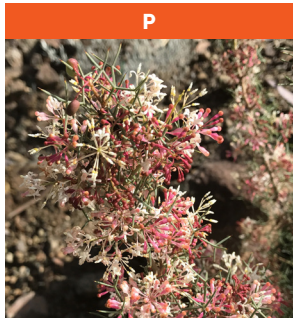
P Grevillea halmaturina ssp. laevis

Native to South Australia Shrub to 3 ft. tall Full sun to partial shade Hardy to 25° F