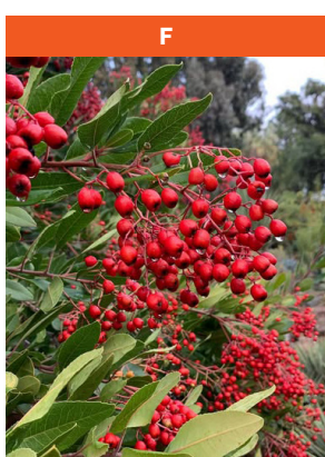
Heteromeles arbutifolia (fruit)

Native to Western Australia Upright shrub to 10 – 16 ft. tall Full sun Hardy to low 20's F