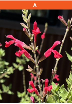
Salvia 'John Whittlesey'

Hybrid; parents native to Mexico Perennial to 3 ft. tall Full sun to partial shade Hardy to 5° F