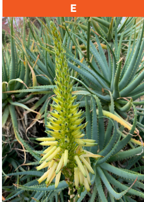
Aloe arborescens (yellow)

Native to South Africa Bulb to 10 in. tall (in flower) Full sun Hardy to low 20's F