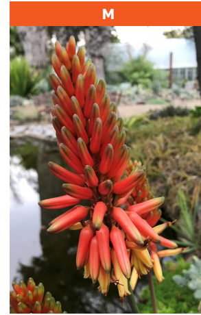
M Aloe cheranganiensis

Hybrid; parents from Australia Shrub to 5-6 ft. tall Full sun Hardy to 25° F