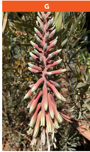
G Aloe niebuhriana

Native to Yemen & Saudi Arabia Clumping; heads to 3 ft. Ø Full sun Hardy to low 20's