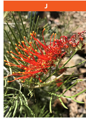
J Grevillea 'Kings Fire'

Native to Yemen Stemless rosette to 3 ft. Ø Full sun to partial shade Hardy to 25° F