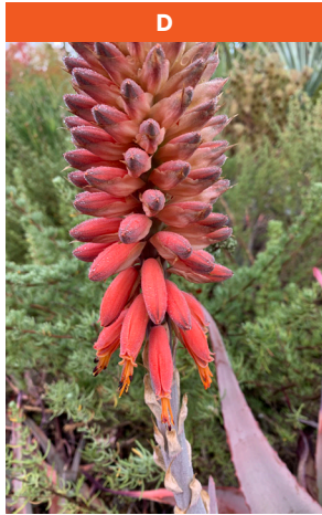
D Aloe rubroviolaceae

Native to California Aromatic perennial to 1.5 ft. Full sun Hardy to low 20's F