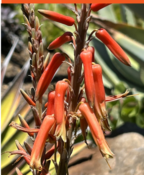
Aloe dhufarensis x brevifolia

Hybrid; parents from South Africa & Oman Stemless rosettes to 10 inches Ø Full Sun to partial shade Hardy to upper 20's F