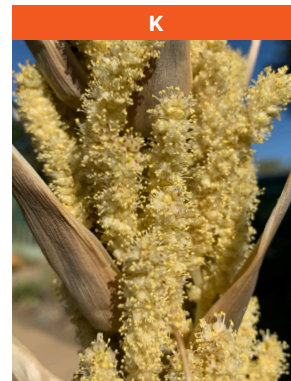
Dasylirion acrotrichum (male plant)

Native to North America & Central America Clumping perennial to 5 ft. tall Shade or partial sun Hardy to -30°F