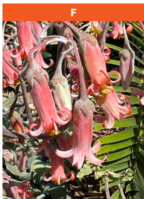
Cotyledon orbiculata ( C. undulata )

Hybrid; parents native to Mexico Stemless rosettes to 3 – 4' Ø Partial shade Hardy to upper 20's F