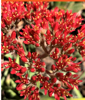
Crassula perfoliata var. falcata

Native to South Africa Clumper to 1½ ft. tall Full sun to part shade Hardy to low 20's F