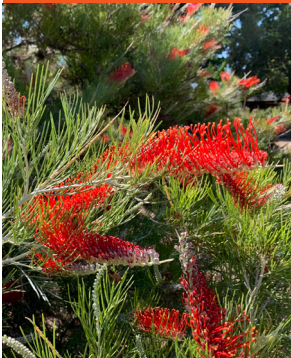
Grevillea 'Kings Fire'

Hybrid; parents from Australia Shrub to 5-6 ft. tall Full sun Hardy to 25° F