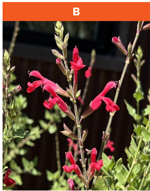
Salvia 'John Whittlesey'

Native to South Africa Clump forming & stemless with rosettes to 2½' Ø Filtered sun Hardy to below 20° F