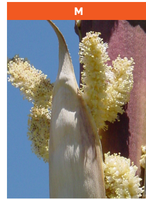
Dasylirion wheeleri (male plant)

Native to Mexico Groundcover to 4 in. tall Full sun to partial shade Hardy to 25° F