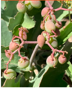
Cyphostemma juttae (poisonous fruit!)

Native to Namibia Thick-stem shrub to 4-6ft. tall Full sun to partial shade Hardy to 25° F