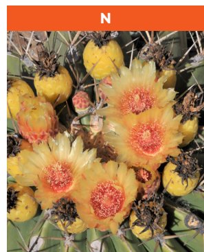
Ferocactus pottsii (fruit)

Native to Mediterranean area Shrub to 3 ft. tall Full sun to light shade Hardy to below 0° F