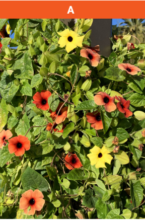
Thunbergia alata cultivar

Native to East Africa Vine Full sun to partial shade Hardy to 28° F