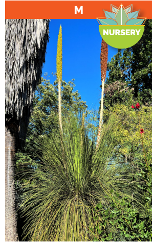
Dasyliirion longissimum (female)

Native to Argentina Clumper to 1½ ft. tall Full sun Hardy to 20° F