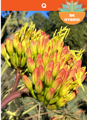
Agave parrasana x colorata

Hybrid with Mexican parentage Stemless rosette to 2½ ft. Ø Full sun to partial shade Hardy to low 20's F