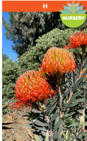
Leucospermum 'Blanche Ito'

Shrub to 5 ft. tall Partial shade Hardy to 15° F