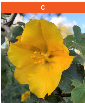
Fremontodendron 'California Glory'

Grass-like clump to 4 ft. tall Full sun to partial shade Hardy to 0°F